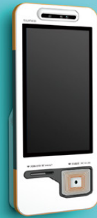
VESA standard wall mount