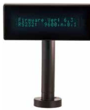
LD222 with Round Base