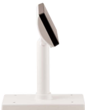
LD222 Flat Screen with Flat Design