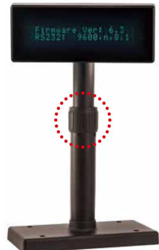
LD222 with Stretch Pole