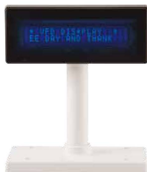
LD222 in Blue Window White Housing