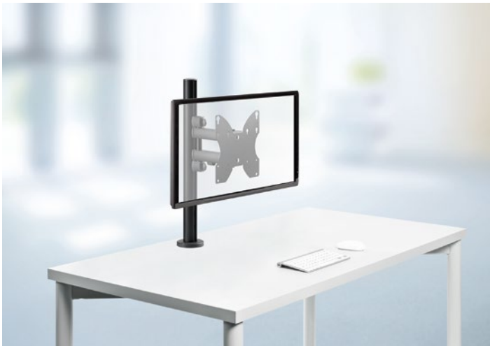
NOVUS POS arm M-TV