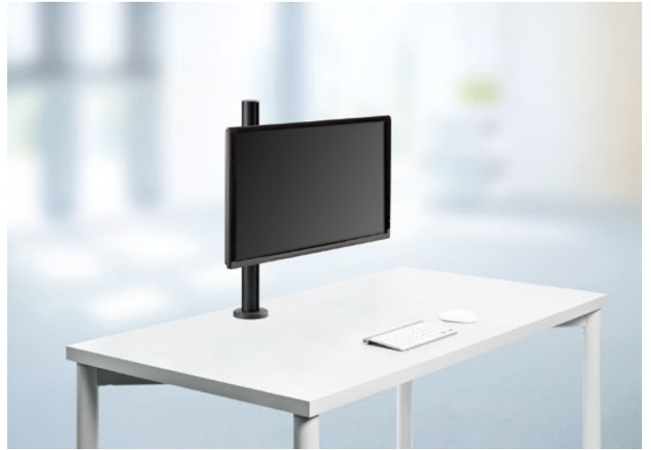
NOVUS POS arm M-TV