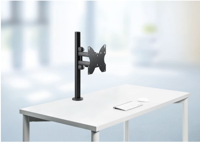
NOVUS POS arm M-TV