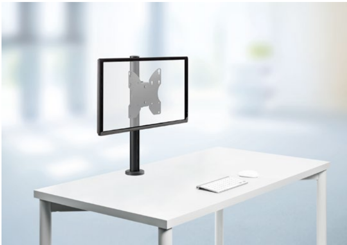
NOVUS POS arm S-TV