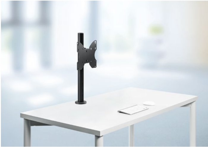
NOVUS POS arm S-TV