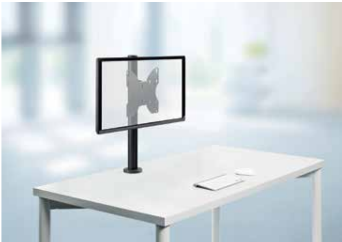
NOVUS RetailSystem arm S-TV