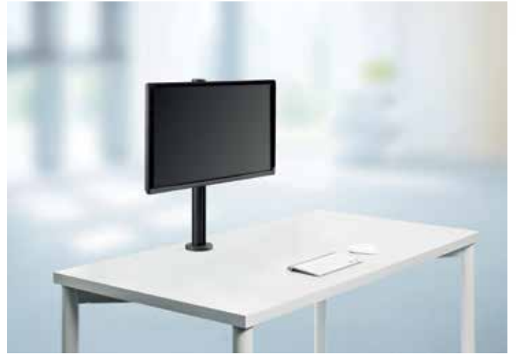
NOVUS RetailSystem arm S-TV