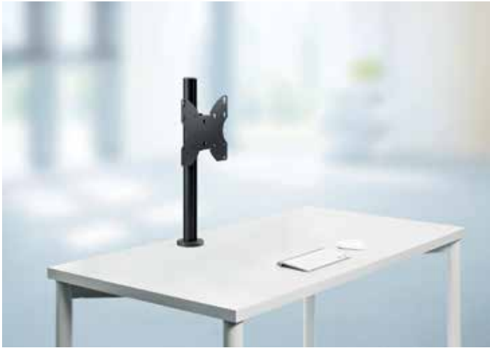
NOVUS RetailSystem arm S-TV