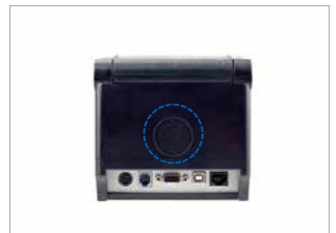
Triple interface USB + Serial + Ethernet