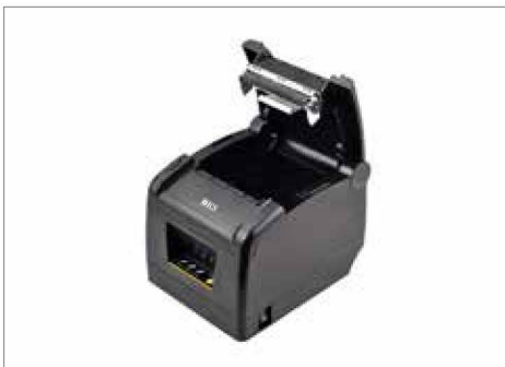
Easy maintenance with Jam release lever