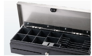
Flip Top for Saving Space