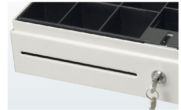
One Media Slot