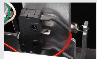
Micro Switch (Sensor)

Code: Lid-FT4617 Dimension: 438*150*57mm