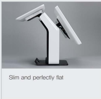
Slim and perfectly flat