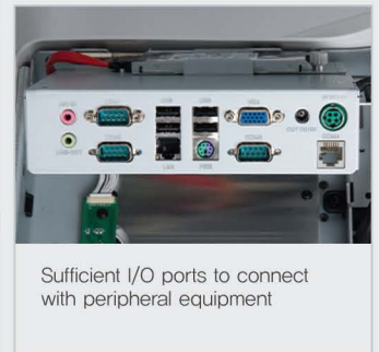
Sufficient I/O ports to connect with peripheral equipment