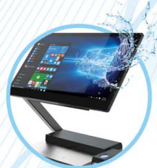
IP54 Whole Unit