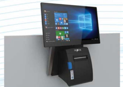
Wall Mount with Printer